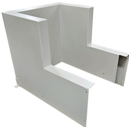
042-434 3 Wall Lead Brick Cave for 042-433

042-435 Lead Brick Cave Cover for 042-434