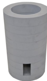
Positron Shield for Capintec Dose Calibrator Chamber

Includes Stainless Steel Cover Specs: Lead Rings Outer Dimensions: 12" Dia x 19.75" H Inner Dimensions: 8" Dia x 17.75" H 575 lbs 2" x 4" cutout in bottom rings for cable