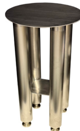
PTI-PS Positron Shield

Positron Stand Supports a dose calibrator and positron shield! Specs: 3-Legged Adjustable Stand Diameter: 13" Adjustable Height from 23" to 25" Weight: 25 Lbs We can customize the design to meet your specifications PS-STAND Positron Stand