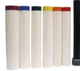
34-210 Calicheck™ Linearity Kit