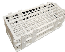
Test Tube Rack Holds up to 90 tubes 0670-0022 Test Tube Rack specify tube size when ordering