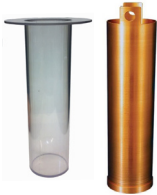
086-241 Well Insert