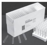
Test Tubes 12 x 75mm test tubes 0670-0016 Test Tubes, 250/pk