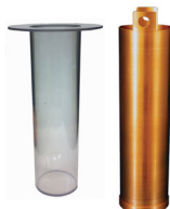
086-241 Well Insert 5120-2286 Copper Liner