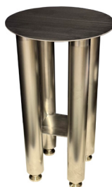
Positron Stand Supports a dose calibrator and positron shield! Specs: 3-Legged Adjustable Stand Diameter: 13" Adjustable Height from 23" to 25" Weight: 25 Lbs We can customize the design to meet your specifications PS-STAND Positron Stand