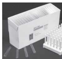
Test Tubes 12 x 75mm test tubes 0670-0016 Test Tubes, 250/pk