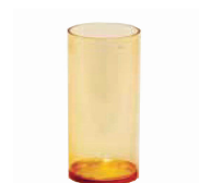
CAPRAC Well Liner