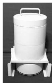
PET Auxiliary Shield CAPRAC-T, CRC-25W and CRC-55tW

Specs: 8 3/4" x 6 3/4" x 16 5/8" 1" thick lead (shield fits snugly around the well chamber for a total of 2" of lead shielding.) Weight: 91 lbs