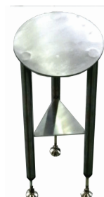
Positron Stand Supports a dose calibrator and positron shield! Specs: 3-Legged Adjustable Stand Height ranges from 22 7/8" to 25 3/8" We can customize the design to meet your specifications PS-STAND Positron Stand