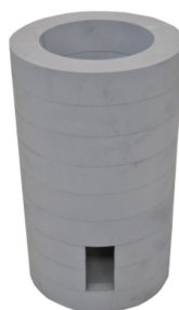
Positron Shield for Capintec Dose Calibrator Chamber

Specs: 2" thick lead split rings 12" outside diameter 19 3/4" overall height 575 lbs 2" x 4" cutout in bottom rings for cable Includes a Stainless Steel Cover (not shown)