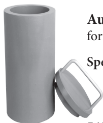
Auxiliary Shield for Well Counter Chamber for CAPRAC-T, CRC-25W and CRC55tW

Specs: 4" Dia x 9 3/4" H with Handle 0.5" thick lead walls and top Weight: 22 lbs