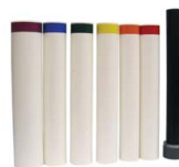
34-210 Calichek™ Linearity Kit