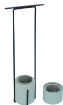
086-423 Moly Assay Shield, Vial, .3" lead 3.5" H x 2" dia