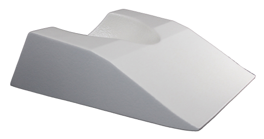
Dimensions: 14.5" W x 17.5" D x 4.5" H