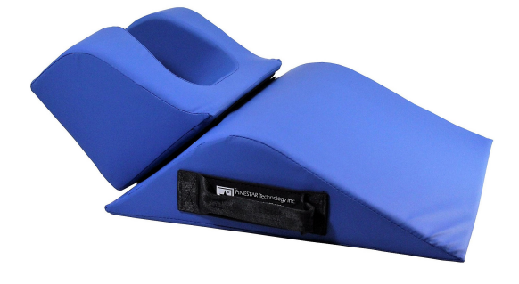
Total Dimensions: 14.25" W x 21" D x 9.5" H

Ideal For Supine Imaging Thyroid Salivary Parathyroid Lymph Nodes