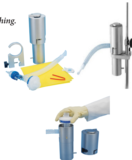
1 Insert Venti-Scan IV Kit in canister