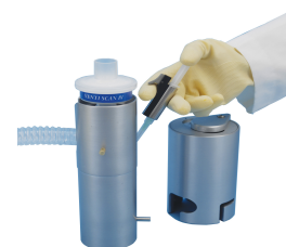
2 Inject Tc-99m DTPA