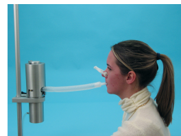
3 Connect to O 2 supply; position patient comfortably for resistance-free breathing