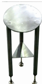
Positron Stand Supports a dose calibrator and positron shield! Specs: 3-Legged Adjustable Stand Height ranges from 22 7/8" to 25 3/8" We can customize the design to meet your specifications