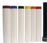
34-210 Calicheck™ Linearity Kit