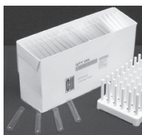
Test Tubes 12 x 75mm test tubes