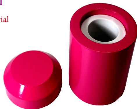
PTI-50-P 1" Lead Vial Shield, 50 ml, Pink

Dimensions: Total Height: 6.3" Internal Height: 4" Lead Thickness: 1" Outer Diameter: 3.8" Inside Diameter: 1.8" Weight: 25 lbs