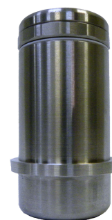
T205 Tungsten Vial Shield, 30 ml

Need a different thickness? Can be custom made to your specifications.