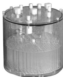
043-772 Designed for PET