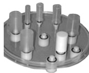
2nd Deluxe Flangeless Lid

The Flangeless SPECT Phantom and the Flangeless PET Phantom meet the requirements set by ACR. The appropriate phantoms provide consistent performance information for any SPECT or PET system. The small SPECT Phantom is an ACR recommended phantom for small field of view dedicated cardiac SPECT systems. Multiple performance characteristics of camera-based SPECT systems are evaluated from a single scan of the phantom.