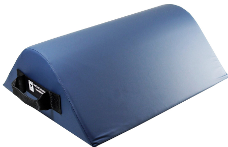
Comfort Leg Rest CLR-807

Care-Cleaning: Spray & wipe clean with any water based medical grade germicidal