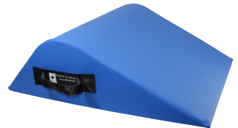
Tapered Leg Rest TAP-807

Be prepared for all your patient positioning needs!