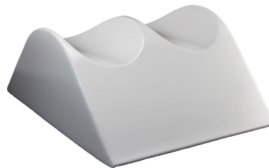
Contour Leg Rest 7" NMC-807