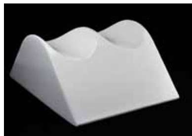
Contour Leg Rest 7" NMC-807