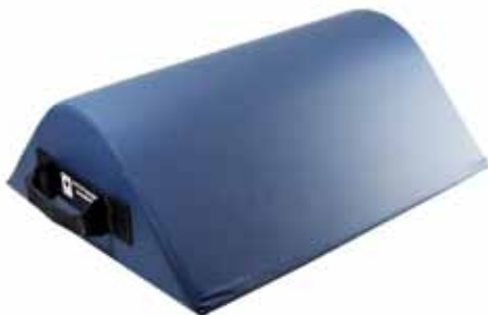
Comfort Leg Rest (Dark Blue) CLR-807

Care-Cleaning: Spray & wipe clean with any water based medical grade germicidal