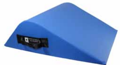
Tapered Leg Rest (Royal Blue) TAP-807

Be prepared for all your patient positioning needs!